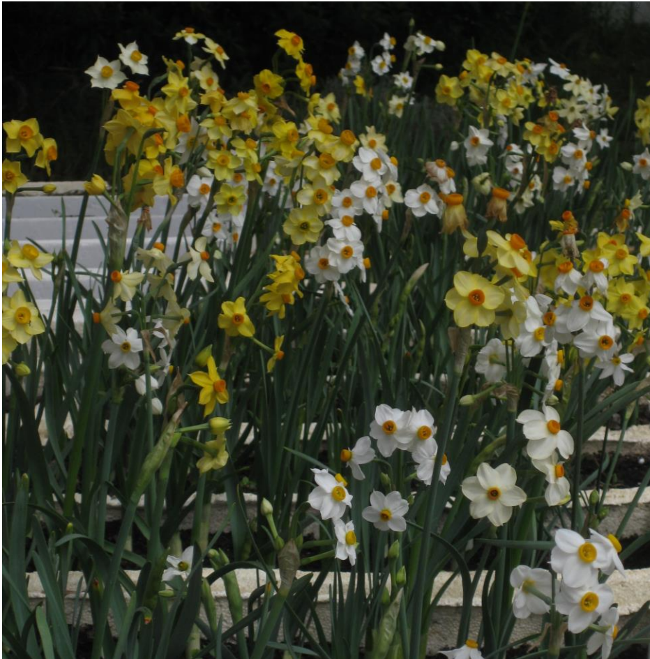
Seedlings March 2020

The mixed seed collections give good genetic diversity and a variety of forms, size and flowering time from autumn into winter. The Autumn Colors+ includes hybrids with my Bairns Sol. The ~8Y-Y means approximately. It is difficult to obtain a uniform 8Y-Y. The best is probably Goldate and it is one of the 4 parents of this seed.